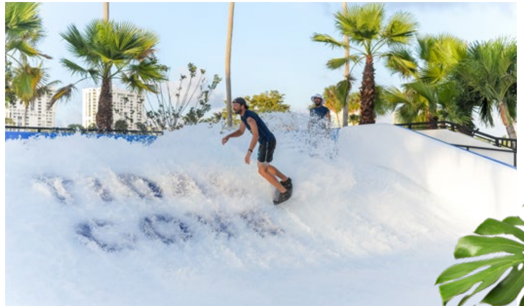
The first-ever FlowRider® Triple surf simulation pool in the nation.