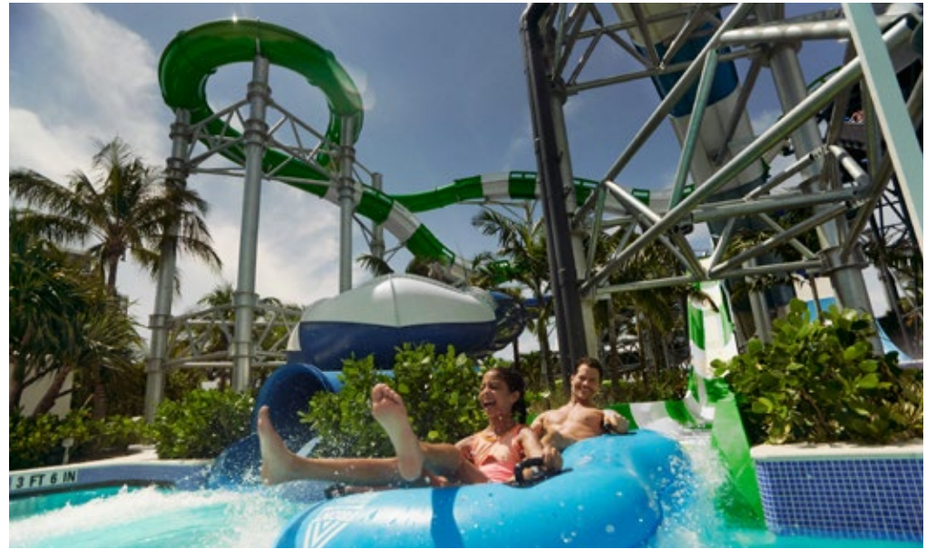
Tidal Cove's 60-foot tower with seven water slides, a 4,000-square foot kids pool with an aquatic play structure.